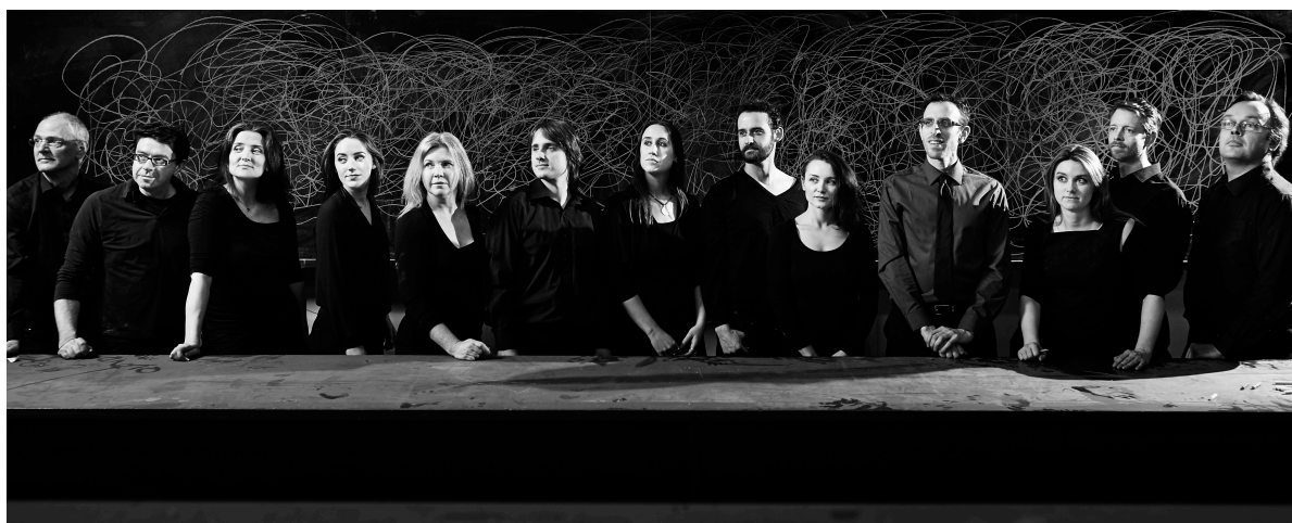
Crash Ensemble.